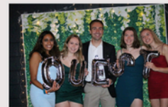
Join a Passionate Community