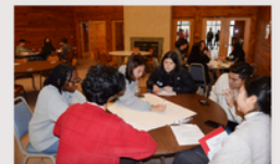
Collaborate with Motivated Peers