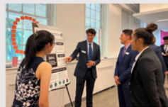
Impact Real-World Clients

Sign up for our prospective student email list: go.umd.edu/quest24